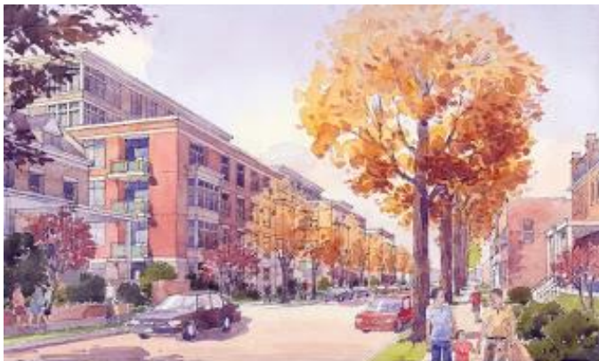
Concept rendering of the new Park Morton

The Park Morton public housing development is part of an ongoing redevelopment program, the New Communities Initiative. This program aims to revitalize severely distressed subsidized housing and redevelop neighborhoods into vibrant mixed-income communities.